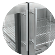
S/Steel Bar Handle