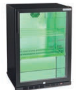
Colour Change LED